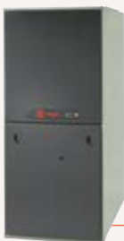
XV95 Furnace With Variable-Speed Motor and Comfort-R™

As part of our continuous product improvement, Trane reserves the right to change specifications and design without notice.